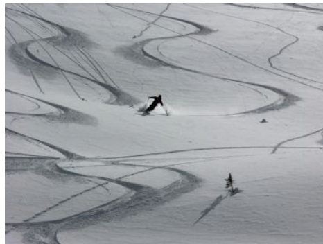
Roger showing the fixed heel crew how to shred